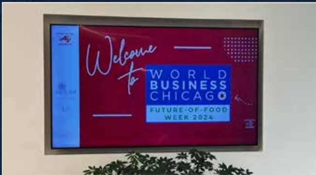
May, 2024: Chicagoland Day for Future-of-Food Week