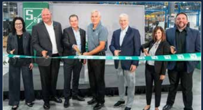
September, 2024: S&C Palatine Grand Opening