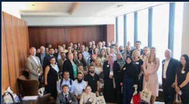
June, 2024: SelectChi 2024: A SelectUSA Spinoff