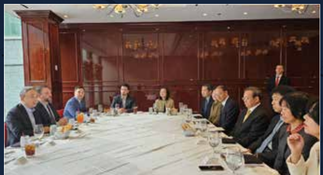
November, 2024: Shanghai-Chicagoland Delegation