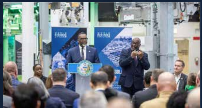
March, 2024: 11 Year Metro Excellence Celebration