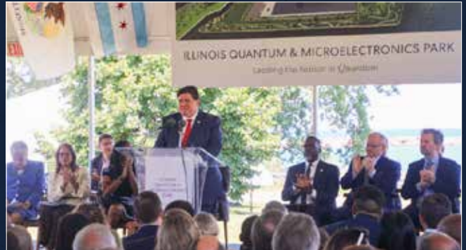
July, 2024: PsiQuantum Announcement