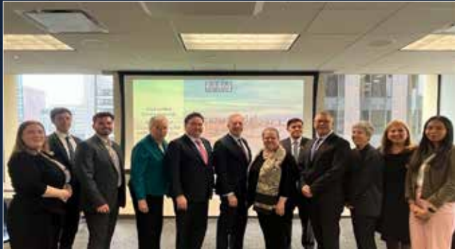
April, 2024: US-ASEAN Business Council Ambassador