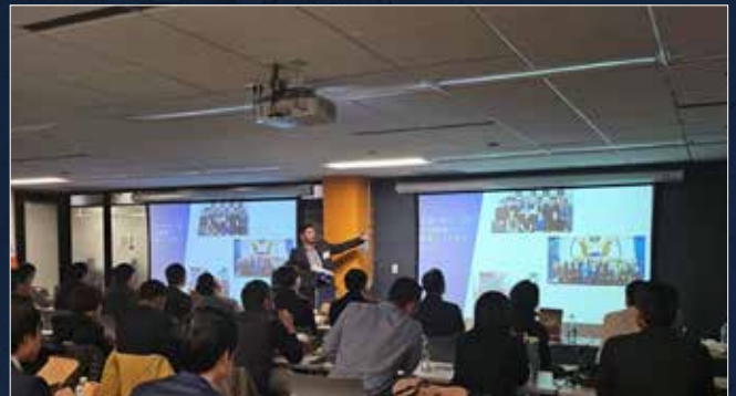
February, 2024: JETRO & GCEP Delegation